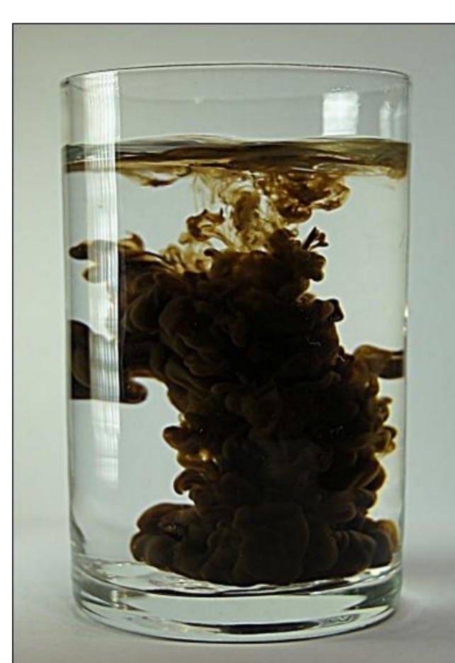
Humic acid (HA)