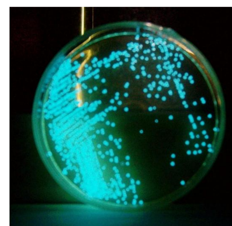
Microtox Vibrio fischeri bacteria