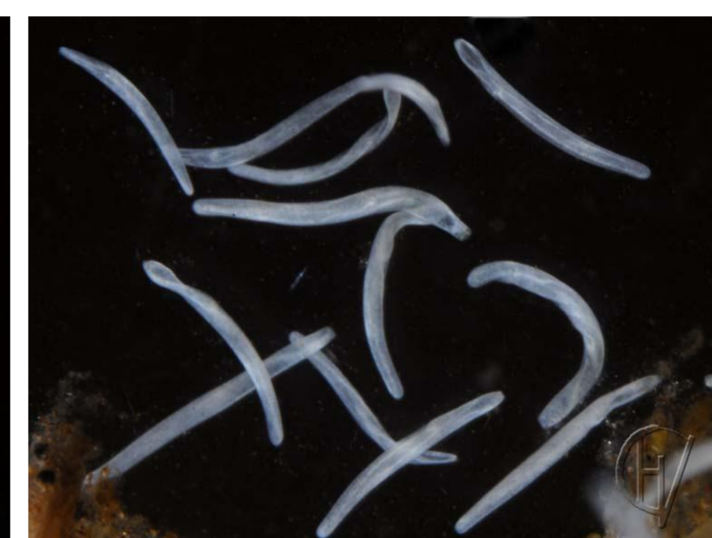
Spirotox Spirostomum ambiguum protozoa