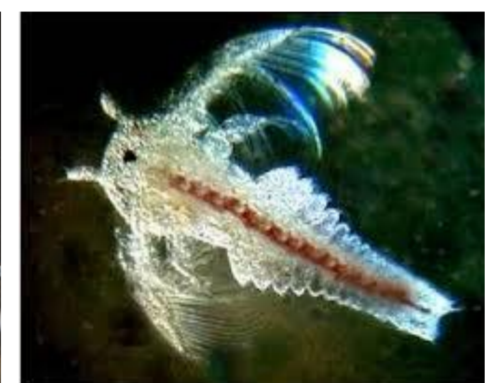
Thamnotoxkit Thamnocephalus platyurus crustacea